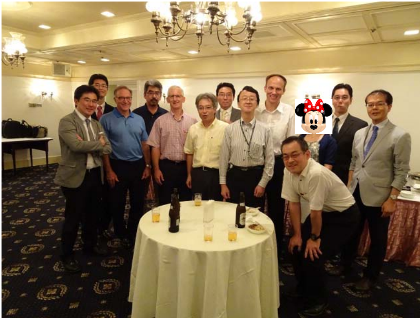
Picture after the meeting.

1 st USRDS and JSJT meeting for future collaboration KKR HOTEL TOKYO, Tokyo, Japan, 17:00 – 20:30, Aug 7 th , 2015